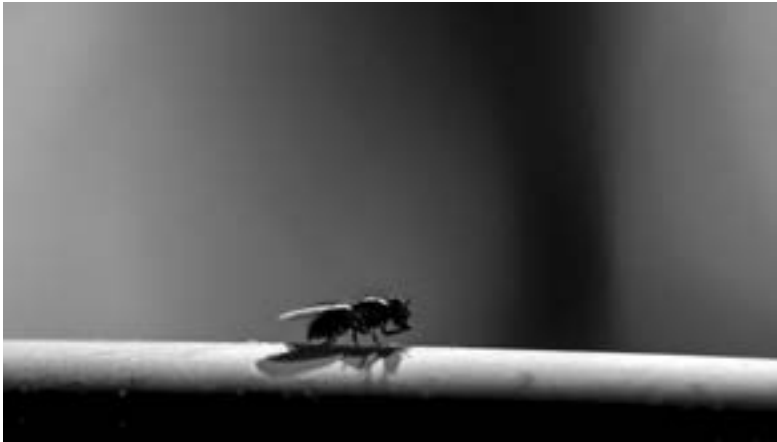
1.3. Walt studies the fly (the flesh-toned smear in the background is Walt's face, which will take form in a rack focus)