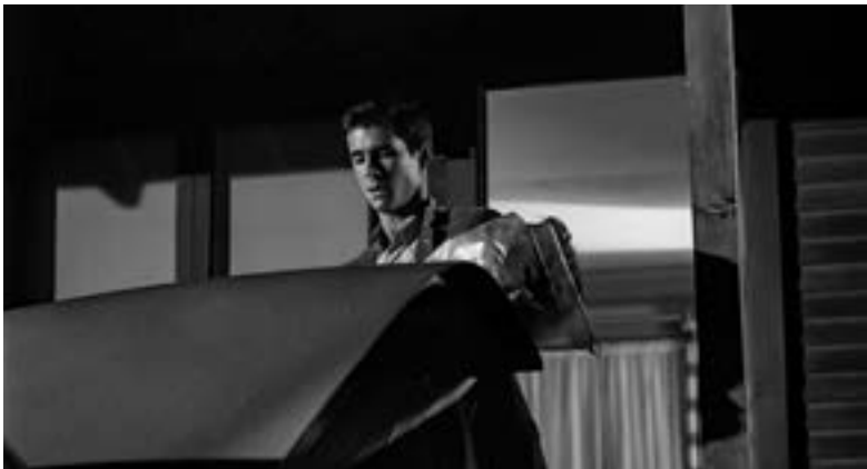
1.6. Psycho : Norman disposing of the body