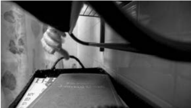
1.9. The camera foregrounds incriminating evidence