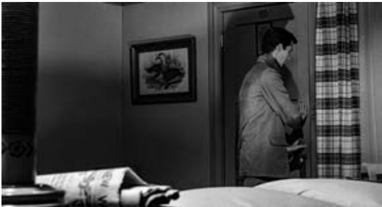
1.10. Psycho : The camera foregrounds incriminating evidence