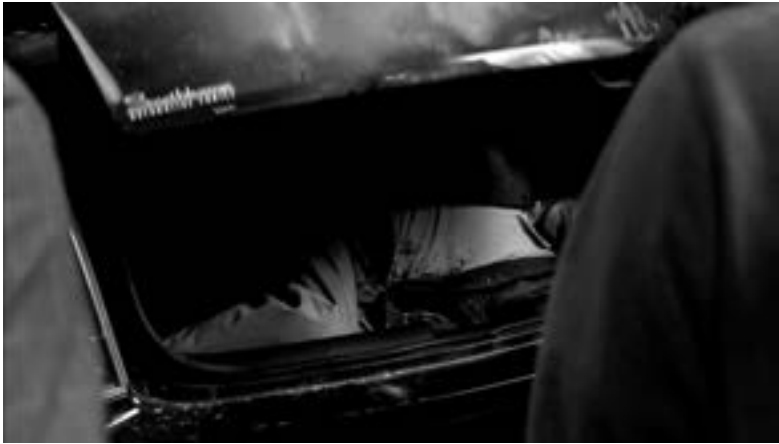
1.5. Disposing of the body