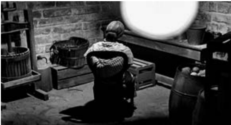
I.2. Psycho (Alfred Hitchcock, 1960): Lila finds "Mother" in the fruit cellar