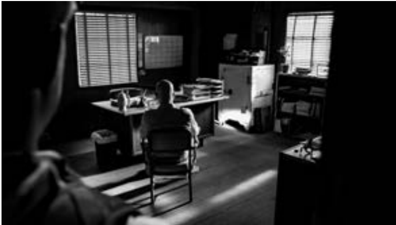
I.1. Todd finds Walt in the Vamanos office