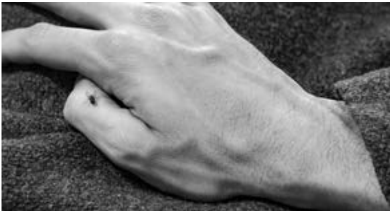
1.4. Psycho : Norman-Mother studies the fly