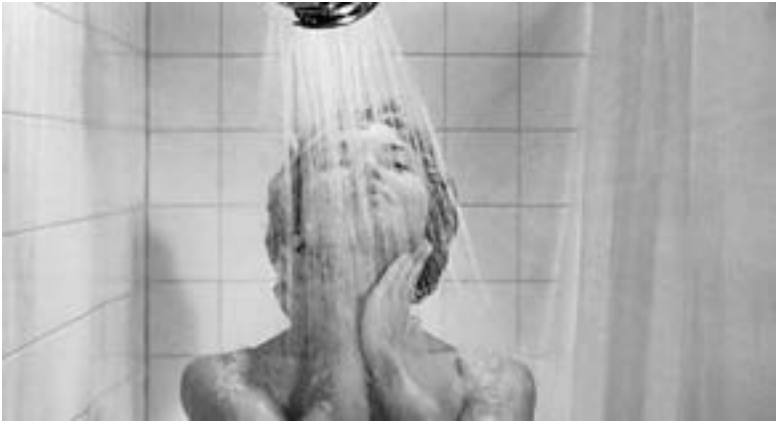
1.7. Psycho : Marion's cleansing shower. Too late!